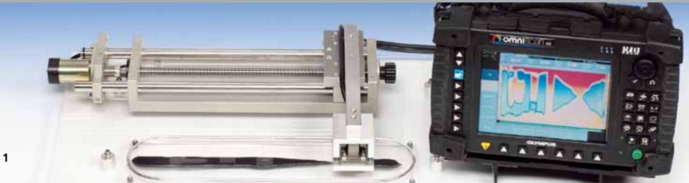
1 Demonstrator for ultrasonic testing of a bonded glass pane.