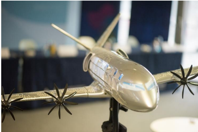
Fig. 2 This is how BTU and chesco envision a future hybrid-electric aircraft