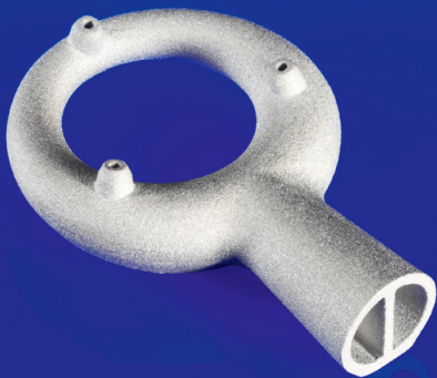
Study of a ring nozzle, status after sintering